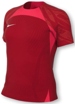
NIKE DF ADV VAPOR IV JERSEY US SS DR0674 Page 10