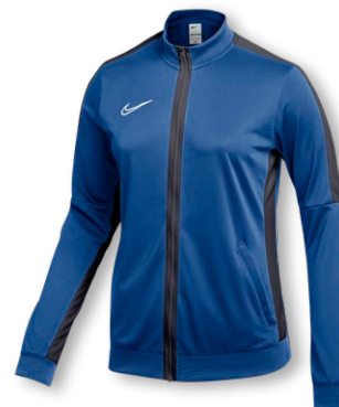
NIKE DF KNIT ACADEMY 23 TRACK JACKET DR1686 Page 48