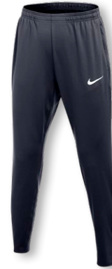
NEW NIKE DF STRIKE 24 PANT KPZ FD7576 Page 38