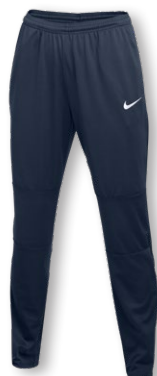
NIKE DRY PARK 20 PANT FJ3019 Page 59