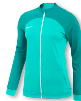
NIKE DF ACADEMY PRO TRACK JACKET K DH9250 Page 51