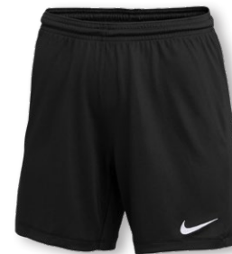
NIKE DRY DIGITAL 20 SHORT CD6120 Page 27