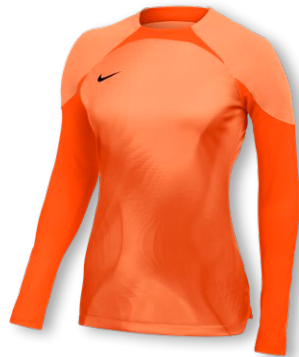
NIKE DF ADV GARDIEN IV GK JERSEY US LS DH8226 Page 32