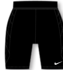
NIKE DF PAD GARDIEN I GK COMPRESSION SHORT CV0055 Page 33