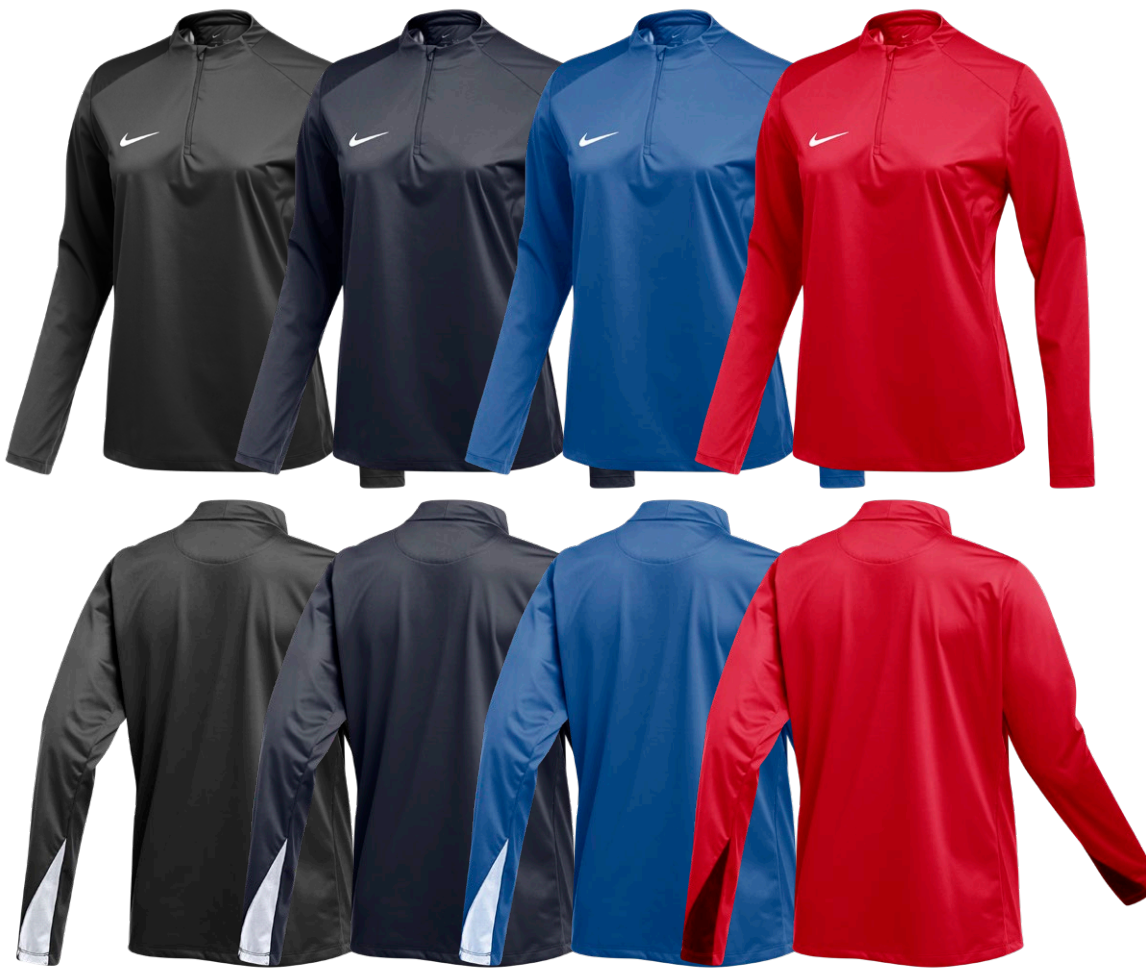
BACK VIEWS TO SHOW SLEEVE COLORS