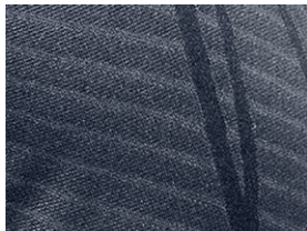
GRAPHIC KNIT DETAIL