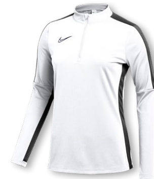
NIKE DF ACADEMY 23 DRILL TOP DR1354 Page 48