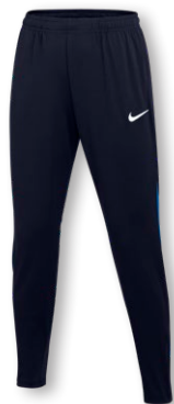
NIKE DF ACADEMY PRO PANT KPZ DH9273 Page 51