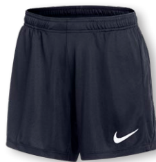
NEW NIKE DF ACADEMY PRO 24 SHORT KZ FD7655 Page 47