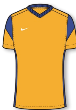
NIKE DRY US SS PARK DERBY III JERSEY CW3832 Page 21