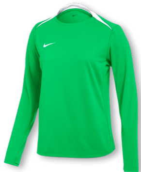
NEW NIKE DF ACADEMY PRO 24 CREW TOP K FD7659 Page 46