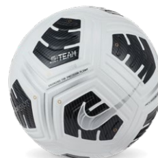
NIKE CLUB ELITE - TEAM CU8057 (NFHS) Page 60