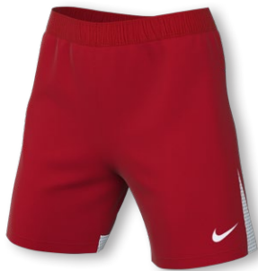
NIKE DF US CLASSIC II SHORT K DH8310 Page 25