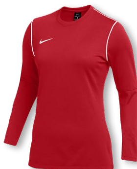
NIKE DRY PARK 20 CREW TOP FJ3006 Page 58