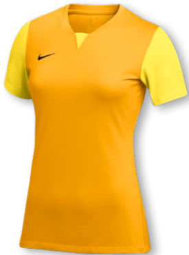
NIKE DF US SS TROPHY V JERSEY DR0940 Page 15