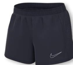
NIKE DF ACADEMY 23 SHORT K DR1362 Page 50