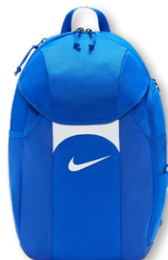
NIKE ACADEMY TEAM BACKPACK 2.3 DV0761 Page 60