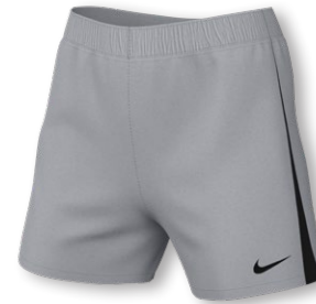
NIKE DF US LEAGUE KNIT III SHORT DR0965 Page 24