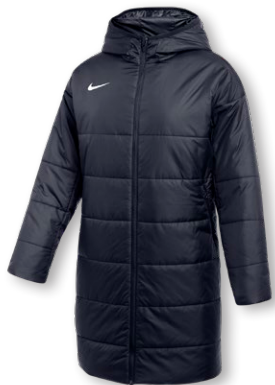
NEW NIKE THERMA-FIT ACADEMY PRO 24 SDF JACKET FD7712 Page 54