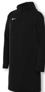
NIKE STORM-FIT ACADEMY HOODED RAIN JACKET DJ6316 Page 55