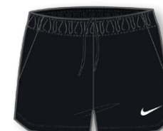
NIKE DRY PARK 20 SHORT KZ CW6154 Page 58