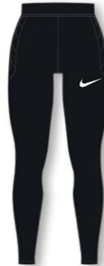
NIKE DF PAD GARDIEN I GK COMPRESSION TIGHT CV0048 Page 33