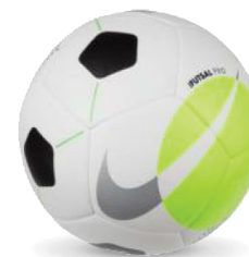
NIKE FUTSAL PRO - TEAM DH1992 Page 60