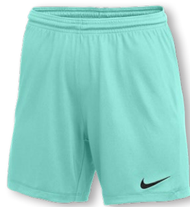
NIKE DRY PARK III SHORT NB BV6862 Page 25