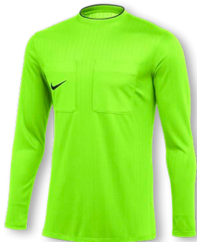
NIKE MEN'S DF REFEREE II LS JERSEY DH8027 Page 35 (MEN'S SIZING. WOMEN'S COMING 1/1/25)