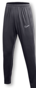
NIKE DF ACADEMY 23 PANT KPZ DR1671 Page 50