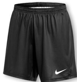
NEW NIKE DF US DIGITAL 24 SHORT 60D FD8772 Page 26