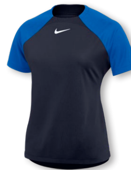
NIKE DF SS ACADEMY PRO TOP K DH9242 Page 53