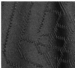
GRAPHIC KNIT DETAIL