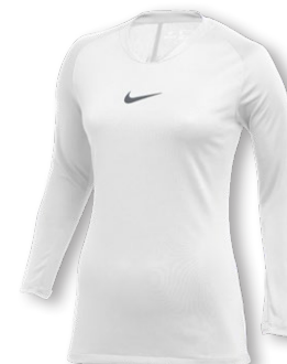
NIKE DRY PARK LS FIRSTLAYER JERSEY AV2610 Page 59