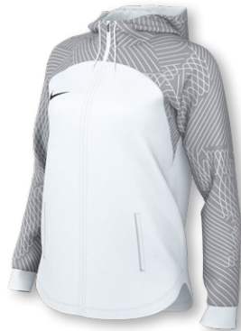
NIKE DF KNIT STRIKE 23 HOODED TRACK JACKET DR2573 Page 41