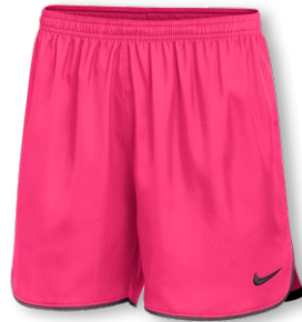
NIKE DF US WOVEN LASER V SHORT DH8302 Page 24