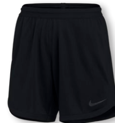
NIKE DF REFEREE SHORT DH8269 Page 35