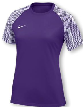
NIKE DF US SS ACADEMY JERSEY DH8232 Page 17