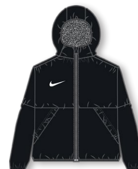
NIKE THERMA REPEL PARK 20 FALL JACKET DC8039 Page 56