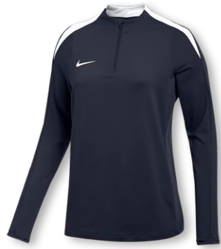
NEW NIKE DF STRIKE 24 DRILL TOP K FD7571 Page 38