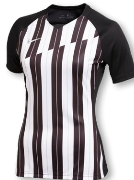
NIKE DRY US SS DIGITAL 20 JERSEY CD6119 Page 27