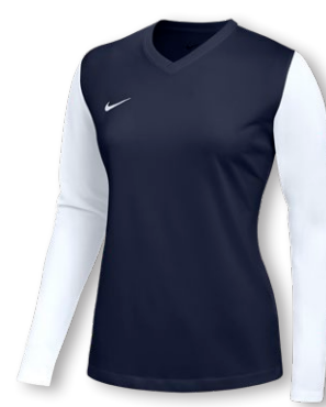
NIKE DF US LS TIEMPO PREMIER II JERSEY DH8236 Page 18