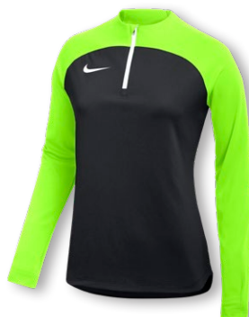
NIKE DF ACADEMY PRO DRILL TOP K DH9246 Page 52