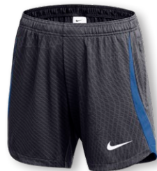
NIKE DF STRIKE 23 SHORT KZ DR2340 Page 43