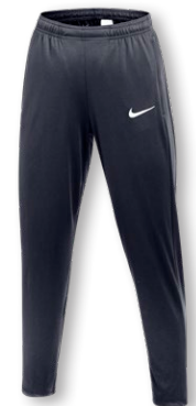
NEW NIKE DF ACADEMY PRO 24 PANT KPZ FD7677 Page 45