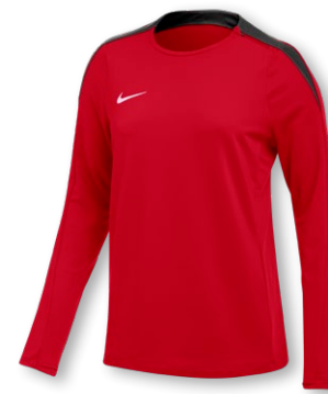
NEW NIKE DF STRIKE 24 CREW TOP K FD7567 Page 39