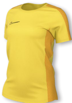
NIKE DF ACADEMY 23 SS TOP DR1338 Page 49