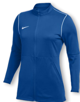
NIKE DRY PARK 20 TRACK JACKET FJ3024 Page 57