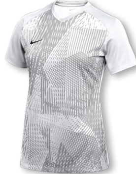
NIKE DF US SS PRECISION VI JERSEY DR0948 Page 12