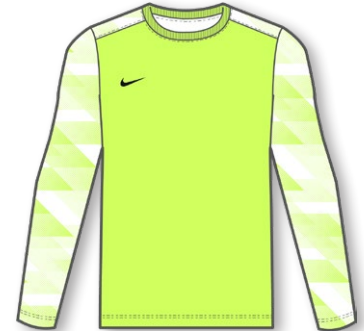
NIKE DRY LS US PARK IV GK JERSEY CJ6071 Page 34