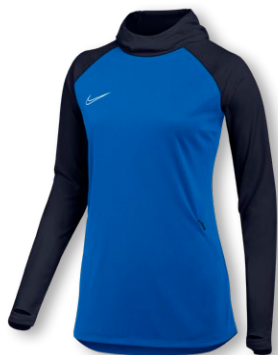
NIKE DF ACADEMY PRO PO HOODIE K DH9248 Page 52