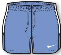
NIKE US WOVEN VENOM SHORT III CW3860 Page 23