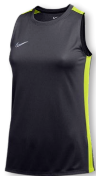
NIKE DF ACADEMY 23 SL TOP DR1332 Page 49