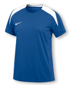
NEW NIKE DF STRIKE 24 SS TOP K FD7490 Page 39