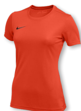
NIKE US SS PARK VII JERSEY BV6730 Page 22