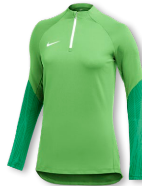
NIKE DF STRIKE 23 DRILL TOP DR2296 Page 42