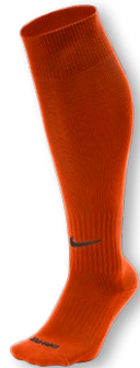
NIKE ACADEMY OTC SOCK SX5728 Page 29