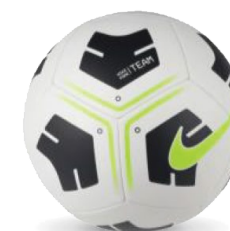
NIKE PARK - TEAM CU8033 Page 60