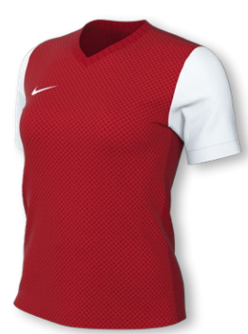
NIKE DF US SS TIEMPO PREMIER II JERSEY DH8235 Page 19