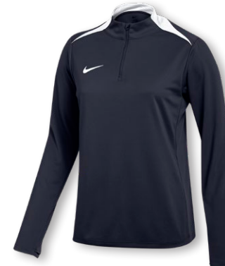
NEW NIKE DF ACADEMY PRO 24 DRILL TOP K FD7669 Page 45