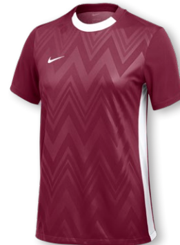
NEW NIKE DF CHALLENGE V JERSEY SS US FD7425 Page 13