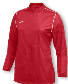
NIKE PARK 20 RAIN JACKET BV6895 Page 57