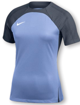
NIKE DF US SS STRIKE III JERSEY DR0910 Page 11