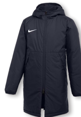
NIKE SYN FL REPEL PARK 20 SDF JACKET DC8036 Page 56