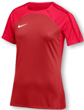
NIKE DF STRIKE 23 SS TOP DR2278 Page 43