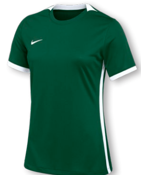
NIKE DF US SS CHALLENGE IV JERSEY DH8231 Page 14