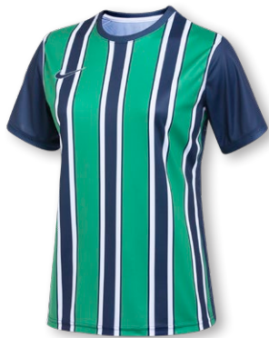
NEW NIKE DF US DIGITAL 24 JERSEY 60D DR2730 Page 26