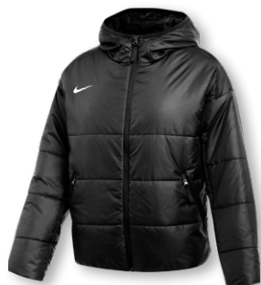
NEW NIKE THERMA-FIT ACADEMY PRO 24 FALL JACKET FD7704 Page 54