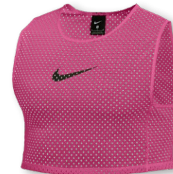
NIKE DRY PARK 20 BIB DV7425 Page 36