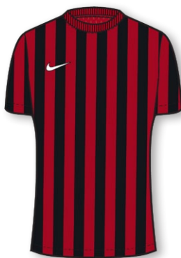
NIKE US SS STRIPED DIVISION IV JERSEY CW3818 Page 16