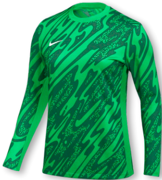
NEW NIKE DF ADV GARDIEN V GK JERSEY US LS FD7479 Page 31