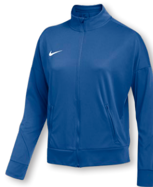
NEW NIKE DF ACADEMY PRO 24 TRACK JACKET K FD7683 Page 44