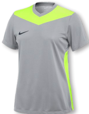
NEW NIKE DF PARK DERBY IV JERSEY SS US FD7437 Page 20