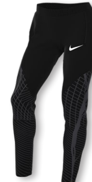
NIKE DF STRIKE 23 PANT KPZ DR2568 Page 42