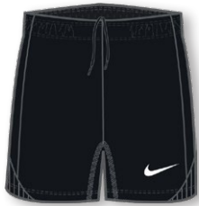
NEW NIKE DF STRIKE 24 SHORT KZ FD7564 Page 40