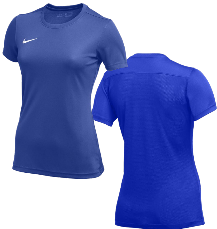
MESH BACK PANEL VIEW