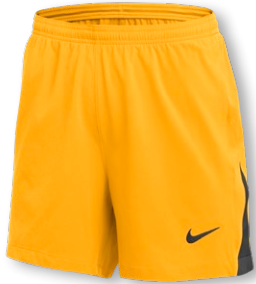
NEW NIKE DF VENOM WOVEN SHORT IV US FD7471 Page 23