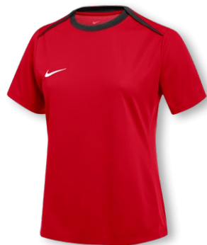
NEW NIKE DF ACADEMY PRO 24 SS TOP K FD7594 Page 46