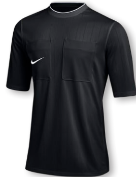
NIKE MEN'S DF REFEREE II SS JERSEY DH8024 Page 35 (MEN'S SIZING. WOMEN'S COMING 1/1/25)