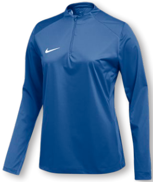
NEW NIKE STORM-FIT STRIKE 24 DRILL TOP FD7589 Page 37