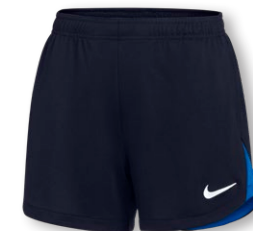
NIKE DF ACADEMY PRO SHORT KZ DH9265 Page 53