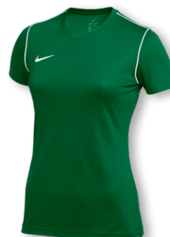
NIKE DRY PARK 20 SS TOP BV6897 Page 58